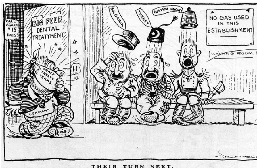
A cartoon from a British newspaper, May 1919. It shows the waiting room of a dentist.