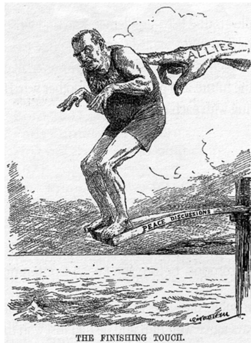
A cartoon published in Britain in 1919.